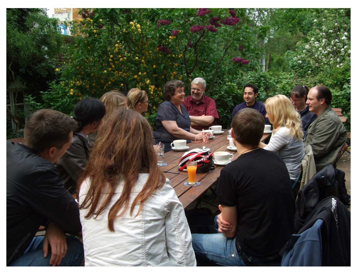
Post-colloquium in the Cafe Heumond